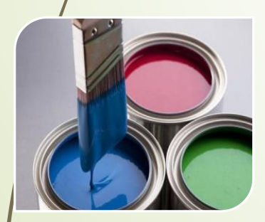
Paint & Coating