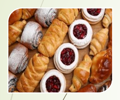
Bakery & Confection ary