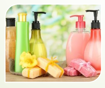
Personal Home Care