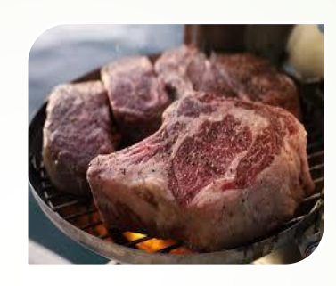
Meat & Culinary